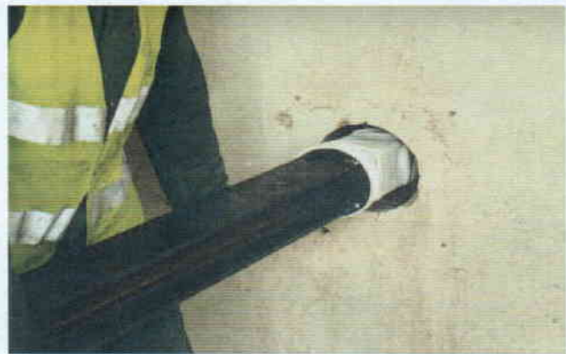
Insertion of Cintec anchor section of 'I' beam into brickwork

The Marriott Hotel was once the old control tower and terminal building for Liverpool Airport. With increased demand two new wings have been added in the same Art Deco style. However in order for pedestrians to access the new development the two existing circular staircases needed to be extended through approx 140° and also rise by approx 750 mm (30 inches). The Architect did not wish for the cantilevered 'I' beams to be bolted to the brick wall with conventional end plates as they would remain visible and so the contracted engineers and Cintec produced a design of casting them in. A 200 mm (8 inch) diameter, 450mm (18 inch) deep hole was hand cored by diamond drilling into the brickwork. All the 100 x 100 (4x4) 'I' beams were fixed to supporting scaffold after insertion and levelled by surveyors. The work was carried out in 2000 by the Liverpool branch of Terminix. Formerly Peter Cox.