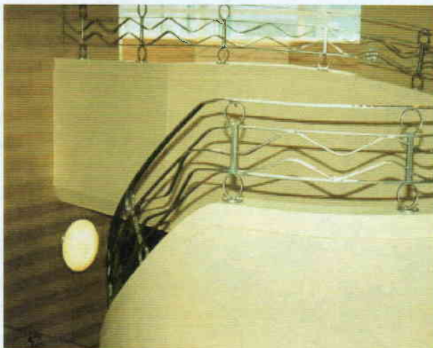
One of the two Cintec Anchor supported stairwells fully renovated.