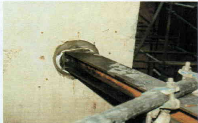
'I' beam following anchor grout injection