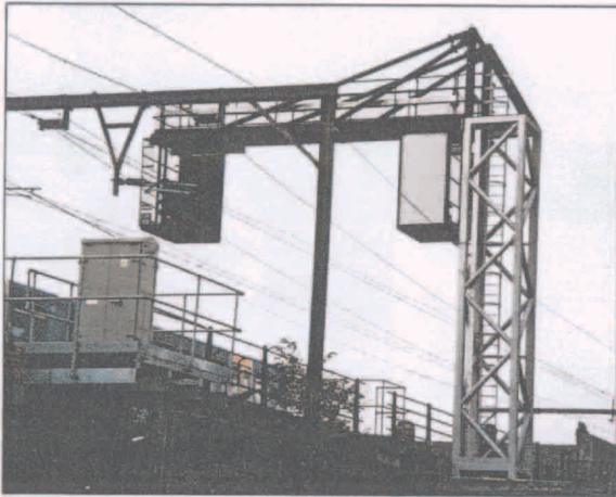
Cantilever Signal System