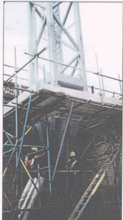
The torqueing of the anchors