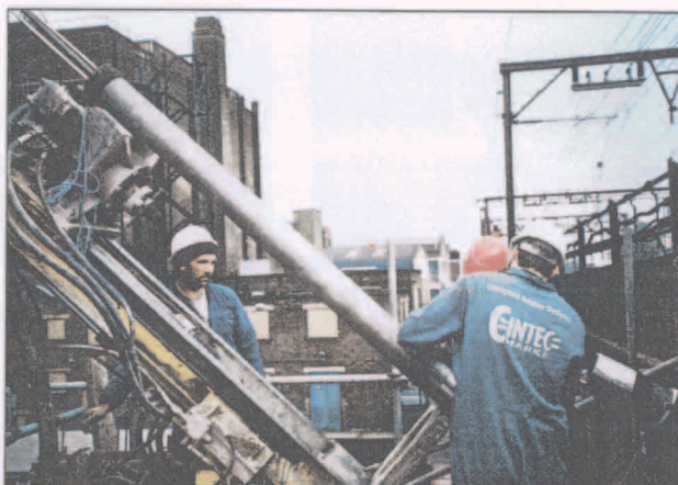
The assembling and installation of a compression anchor

A system was required to secure the gallows to the bridge arches; in their preliminary planning, Railtrack anticipated a shut down of the tracks for 6 weeks. Such a closure would mean a chaotic time table, irate passengers and a loss of revenue. The CINTEC Anchoring System proposal provided a solution that would require only 2 days of rail shut down.