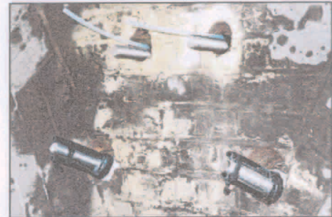
Shear anchors shown at the top and tension anchors at the bottom

As a result of the use of a CINTEC installation, disruption was reduced from 6 weeks to 2 days together with a 50% saving on the original budget Railtrack had allocated to the project.