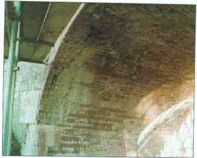
Typical damage to the soffit of the bridge

The Highways and Transportation Department of East Sussex County Council is responsible for the maintenance of the 200 year old brickwork arch bridge adjacent to Bodiam Castle. In recent years this has suffered from the effects of increasingly heavy traffic exacerbated by very cold winters in 1986 and 1987. This led to cracking of brickwork adjacent to the arch voussoirs, some movement in the spandrel walls and delamination of the wing walls at the south end. The County Council approached Cintec International with a view to using Cintec anchors for tying across the arch.