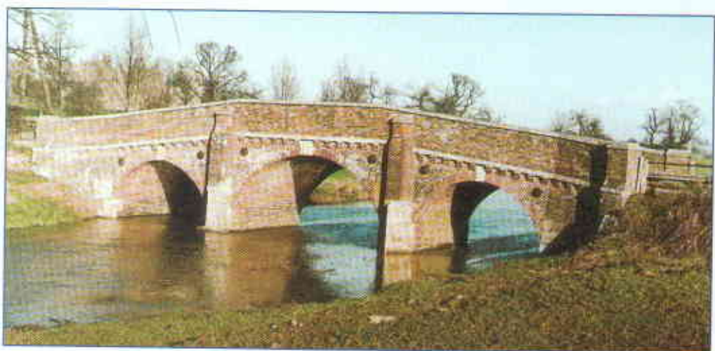
Bodiam bridge after completion with the castle behind the trees in the background.

The use of Cintec anchors for Bodiam bridge gives a number of major advantages over conventional cement or resin grouted anchors. Conventional grouted anchor systems can have problems in the grouting, and there are doubts about the effectiveness of the anchors, when large volumes of grout are lost into voids within the