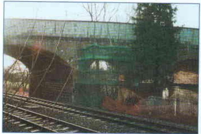
British Rail Bridge Stow-on-the-Wold