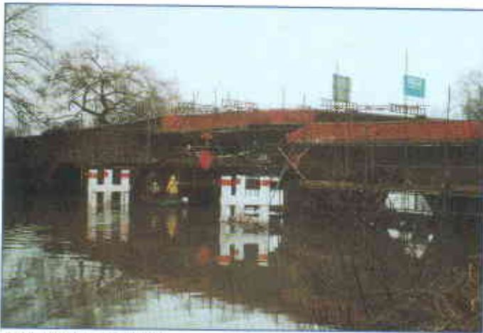
Historic Sonning Bridge at Reading