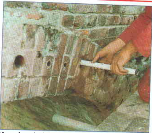
Placing the anchor in the prepared hole

lower courses of brickwork towards the northern end of the bridge, which disappears as the construction continues upward. Presumably this was due to some of the timber piling settling during construction. The cast-iron end bosses of previous ties between the spandrel walls can be seen on both elevations. In 1980 an inspection carried out by divers revealed that the timber piles on which the bridge is founded had become exposed and were deteriorating. In 1982 a concrete filled Fabriform mattress was installed to provide a solid invert and protect the foundations of the bridge. Also in 1982 the approach ramps to the bridge were filled by up to 200mm to minimise the hump. A principal inspection and assessment in 1989 concluded that remedial works to the arch rings and a weight limit of 17 tonnes were required to prevent further deterioration. This weight limit remains in force after the remedial works have been completed to preserve the bridge but will still allow coaches over to visit the adjacent Bodiam Castle, a National Trust property.