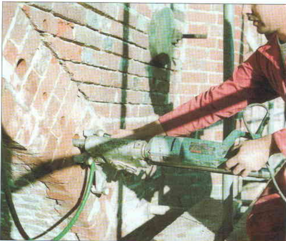
Core drilling holes for the anchors

The bridge is a single track, hump-backed triple arch structure in brickwork and there are signs of various remedial works throughout its life. There appear to have been problems with the original construction for there is pronounced twist in the