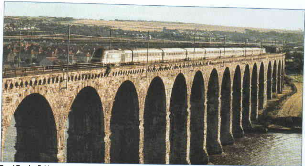
Royal Border Bridge, carrying London - Edinburgh mainline train.