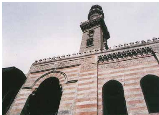
Christ Church Cathedral Dominates Newcastle skyline

At 10:27 am on Thursday 28th December 1989, the city of Newcastle, in New South Wales was struck by the first significant earthquake to affect an Australian urban area. The Earthquake, registering 5.6 on the Richter scale and with a Modified Mercalli Index of up to VIII, had an epicenter approximately 14 km south west of the city's centre. The most important building to be severely damaged was Christ Church Cathedra.